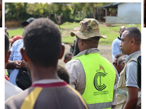
Lower Highlands team doing awareness with locals in Lufa District, Eastern Highlands Province.