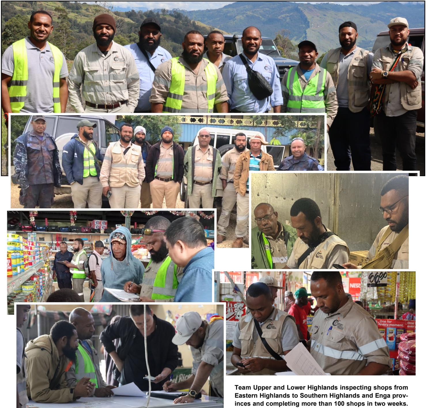
Team Upper and Lower Highlands inspecting shops from Eastern Highlands to Southern Highlands and Enga provinces and completing more than 100 shops in two weeks.