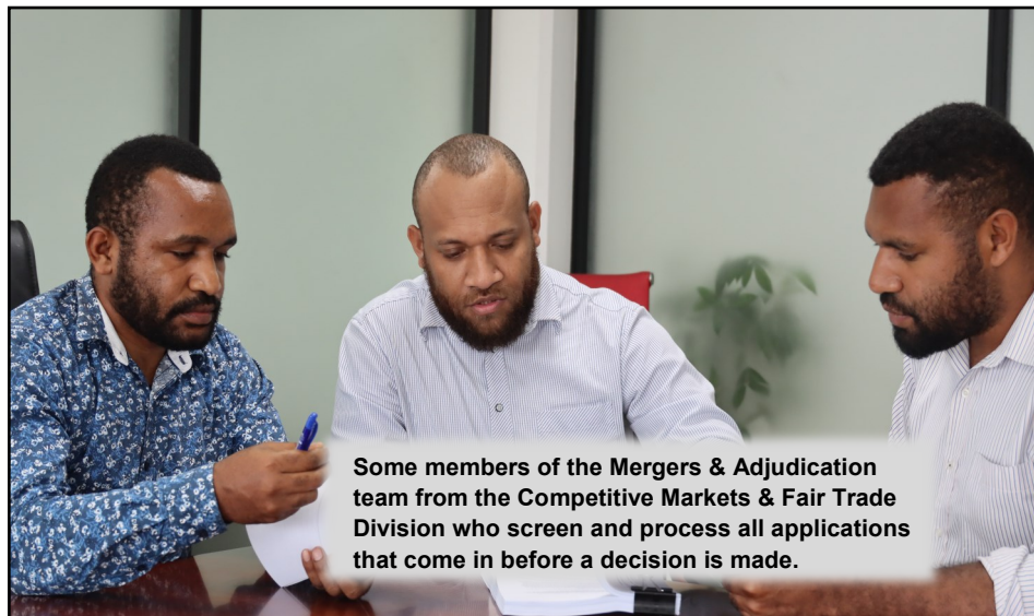
Some members of the Mergers & Adjudication team from the Competitive Markets & Fair Trade Division who screen and process all applications that come in before a decision is made.