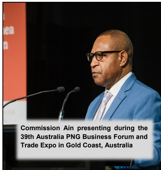
Commissioner Ain presenting during the 39th Australia PNG Business Forum and Trade Expo in Gold Coast, Australia