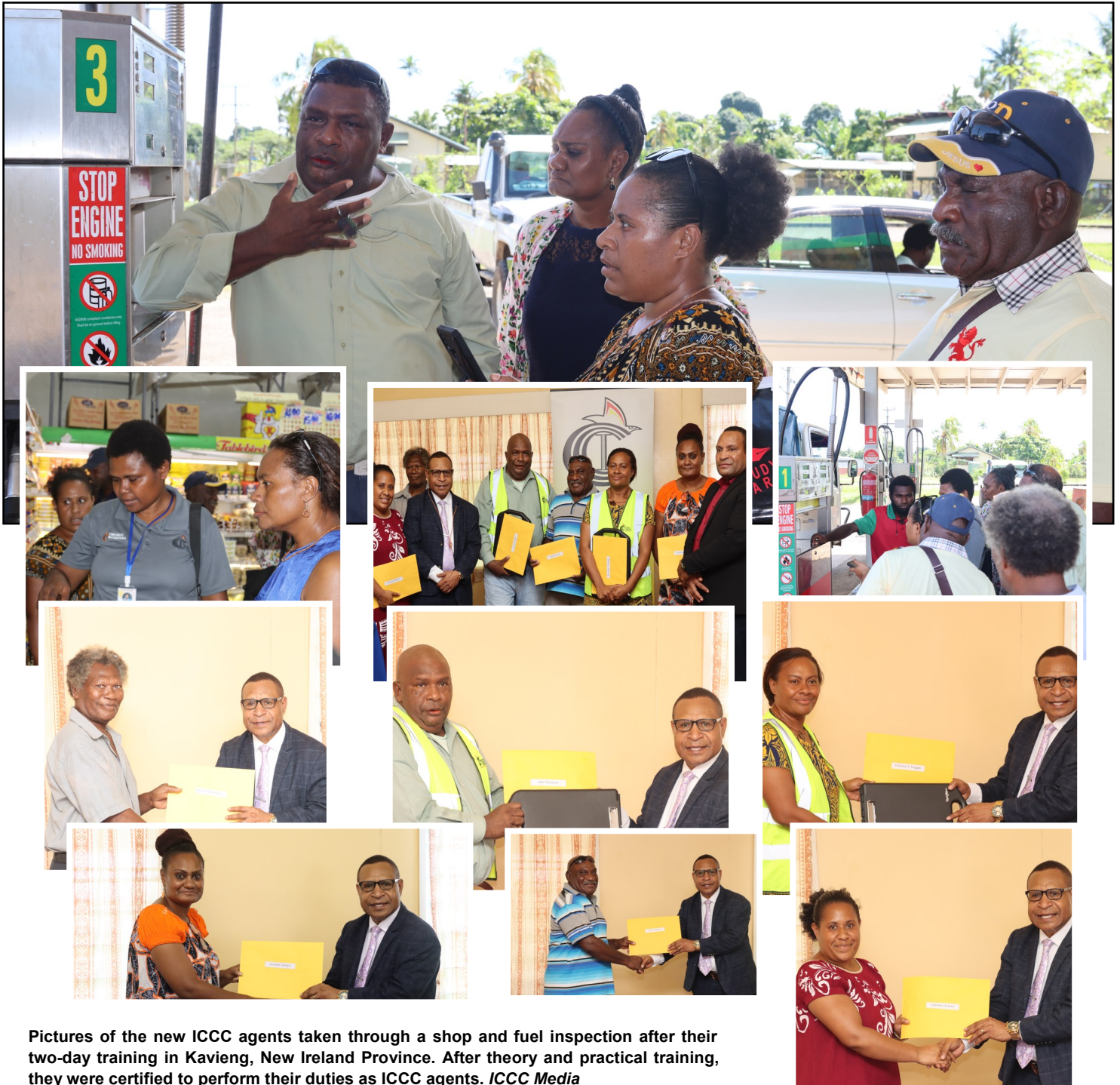
Pictures of the new ICCC agents taken through a shop and fuel inspection after their two-day training in Kavieng, New Ireland Province. After theory and practical training, they were certified to perform their duties as ICCC agents. ICCC Media